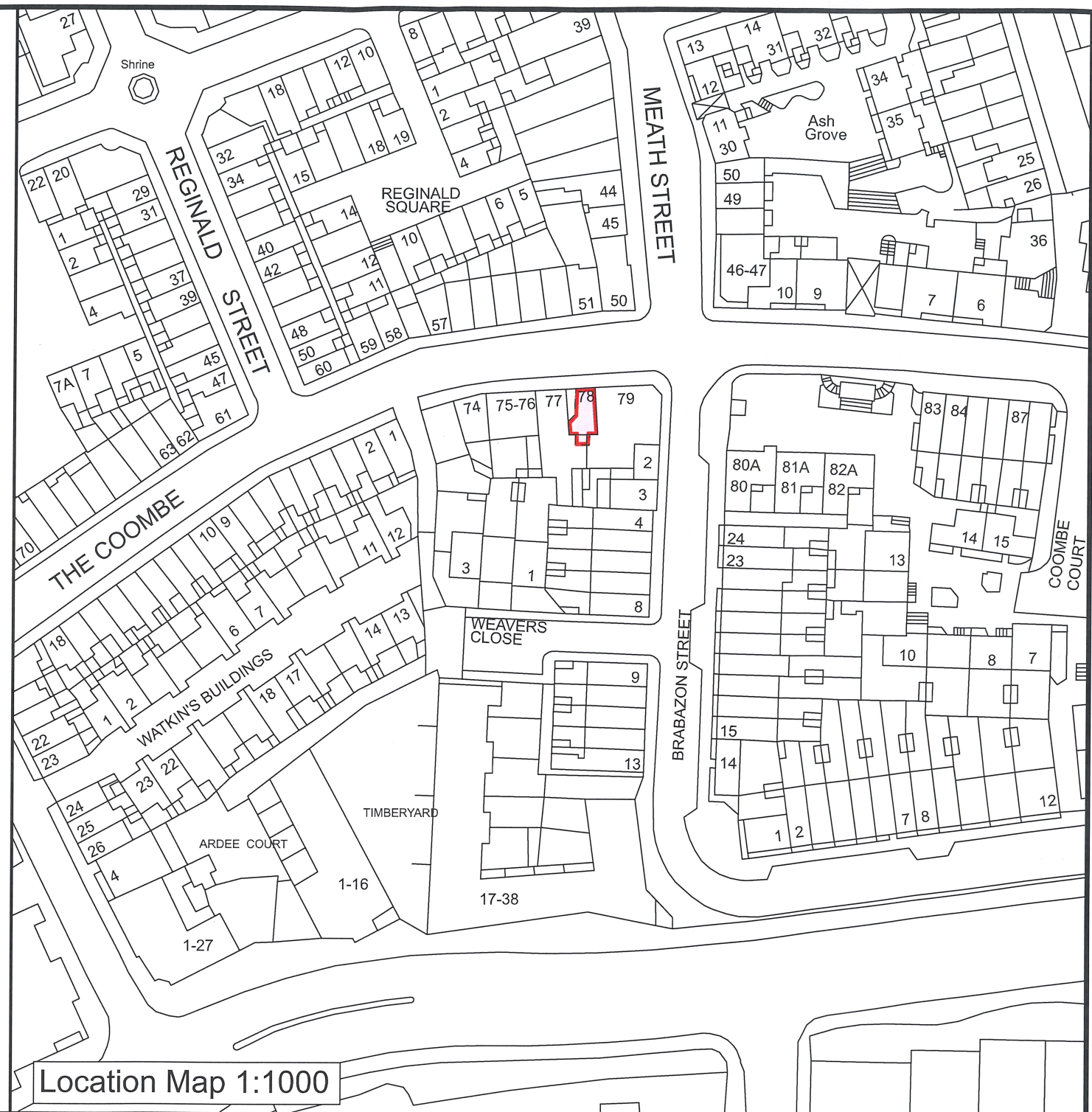
Location Map 1:1000